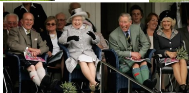
Patron: HM King Charles III